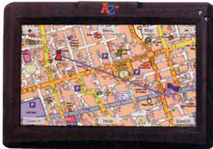
Designed for taxi drivers

Last year following a series of attacks and assaults on cab drivers, the LTDA ran a free course of Krav Maga self-defence classes for members. These were an enormous success and many of the