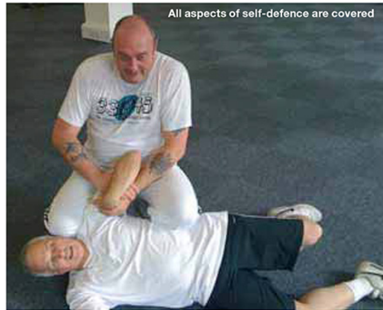
All aspects of self-defence are covered

“THE LTDA IS NOW GOING TO RUN ANOTHER SERIES OF FREE INTRODUCTION CLASSES FOR ANY MEMBERS WHO WERE UNABLE TO GET A PLACE ON THE LAST COURSE”